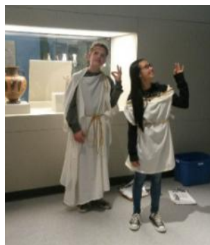
Grade 8 students visited the Winnipeg Art Gallery.