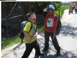
High School Leadership Class went to the zoo with Pritchard students.