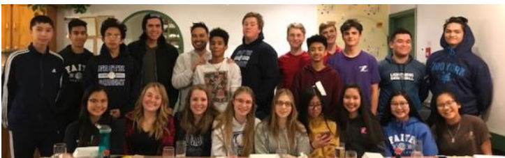
The boys and girls junior varsity volleyball teams and coaches.