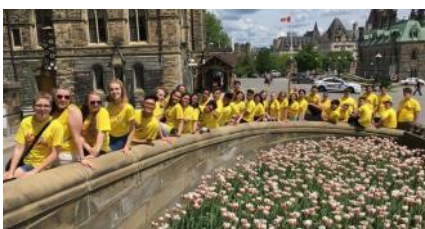
Grade 11 students enjoying our nations capital.