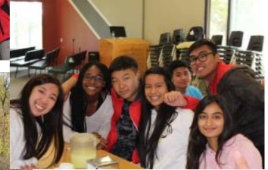
Grade 12s spent a few days together at Roseau River for a retreat.