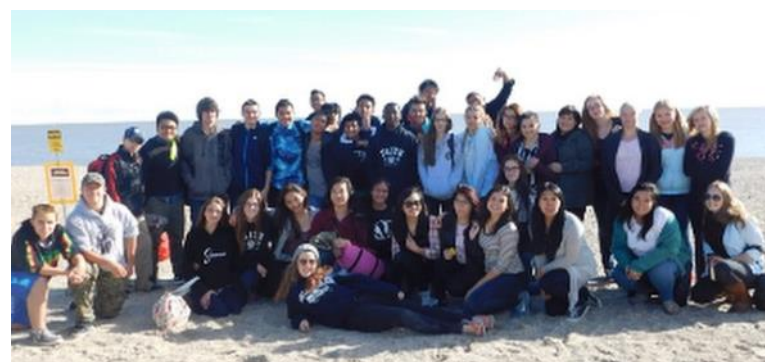
Grade 10s went to Gimli for a one day retreat.

Please consider this option when you are cleaning out your closets.