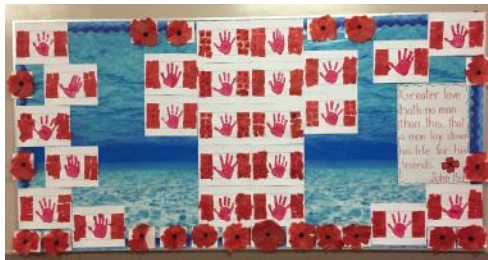
Remembrance Day bulletin boards in the elementary school.